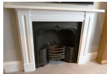
Selection of Photos